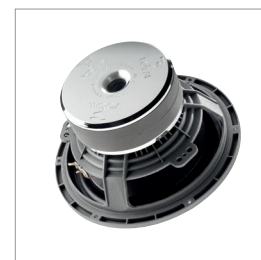
Speaker Sub 500 P HP