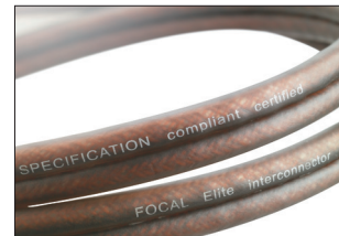
"Flexible PVC Soft Touch" insulator. Translucent light black.