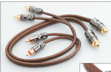
"Y" 0.5m (x2) extension cord.