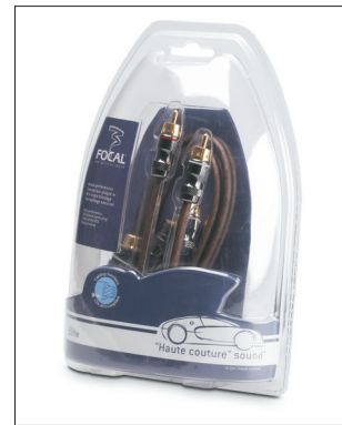
Individual plastic packaging.