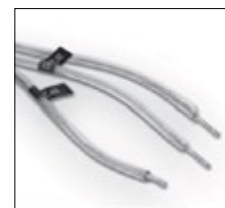
Assembly options: car and display