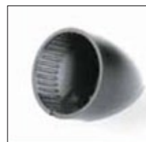
Tilted mounting Easy installation