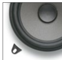
Removable ABS clips (2/3/4 holes fixing points)