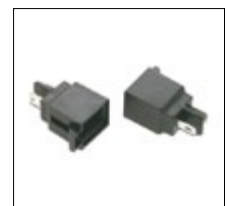
ISO connector (woofer)