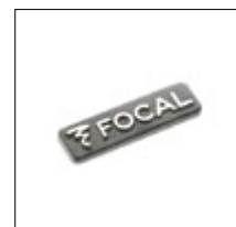
Focal logo (aluminium -diamond cutting)