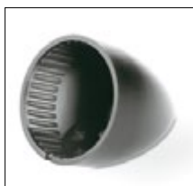
Tilted mounting Easy installation