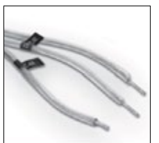
Assembly options: car and display