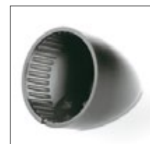
Tilted mounting Easy installation