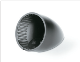
Tilted mounting Easy installation