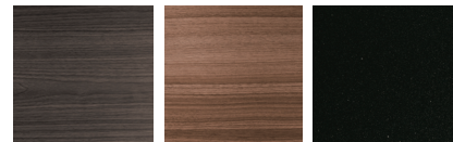
Ebony (satin) Natural (matte) Acrylic body