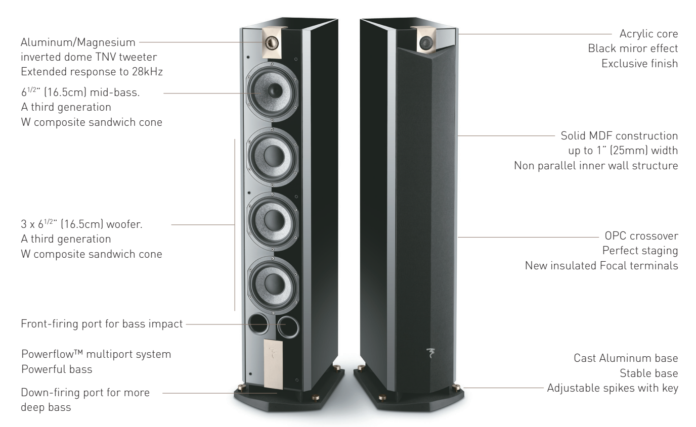
Chorus 836 V W, Black High Gloss finish

Thanks to the W composite sandwich cone technology, this flagship product of the Chorus 800 V line puts itself at center stage. With an even tighter and more dynamic bass, thanks to the rigidity of the cones in the 3 woofers, and a clearer and more precise mid-range, thanks to its lightness and damping factor of the cone, the Chorus 836 V W provides strong and precise sound, generosity, power and finesse, no matter what the style of music.