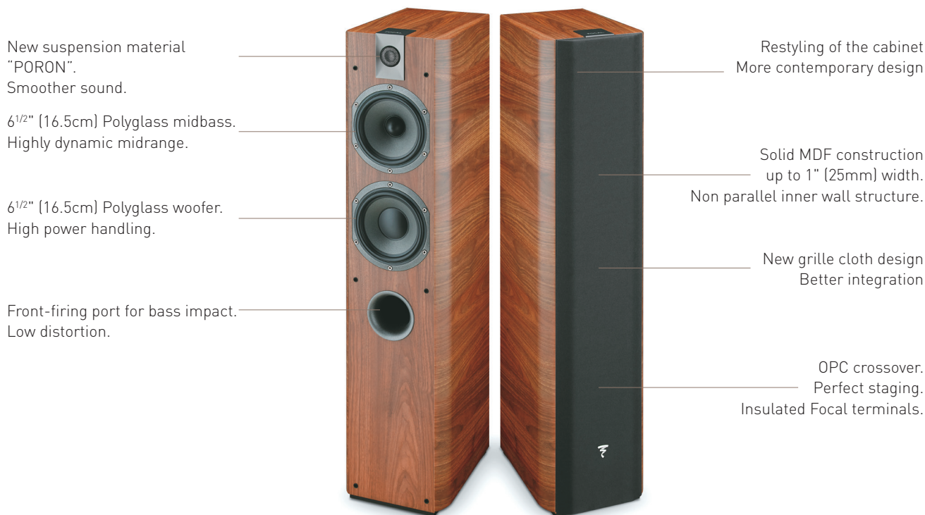
Chorus 716, Walnut finish.

Chorus 716 is a 2.5-way loudspeaker with a high-end configuration thanks to its two 6.5" (16.5cm) speaker drivers working in tandem (only the top driver transmits the midrange). This configuration doubles the effect of the bass, perfect for rooms measuring up to 320ft 2 (30m 2 ).