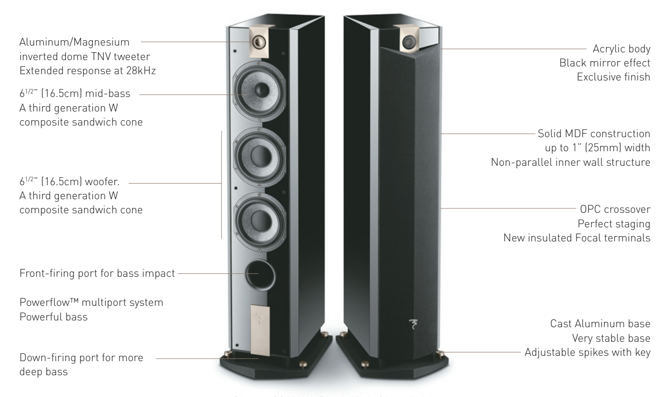
Chorus 826 V W, Black High Gloss finish

The Chorus 826 V W, the benchmark floorstander in this range, uses the W composite sandwich cone to its full potential. Dynamics and definition leap out, bringing a new dimension to the "Affordable Luxury" of the Chorus 800 V line. More than ever, the Chorus 826 V W embodies the values of the "Spirit of Sound", technology, pleasure, performance and tradition.