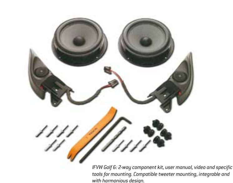
Because we make internationally recognized acoustic loudspeakers and because our R&D department innovates to supply our production workshops, we are proud to in

This "ready to play" kit joins a promising program aimed at specific vehicles sold worlwide.