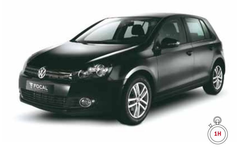
Installation 100% dedicated to Volkswagen Golf 6 in less than an hour. Watch the demonstration video: http://www.focal.com/en/ifvw-golf6

The result is a pure enveloping sound with great neutrality. Enjoy!